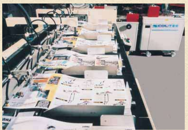
Refurbished 6 station SRA3 collator and stitch/fold/trim line installed at customers premises, overall dimensions 390 x 110 cms